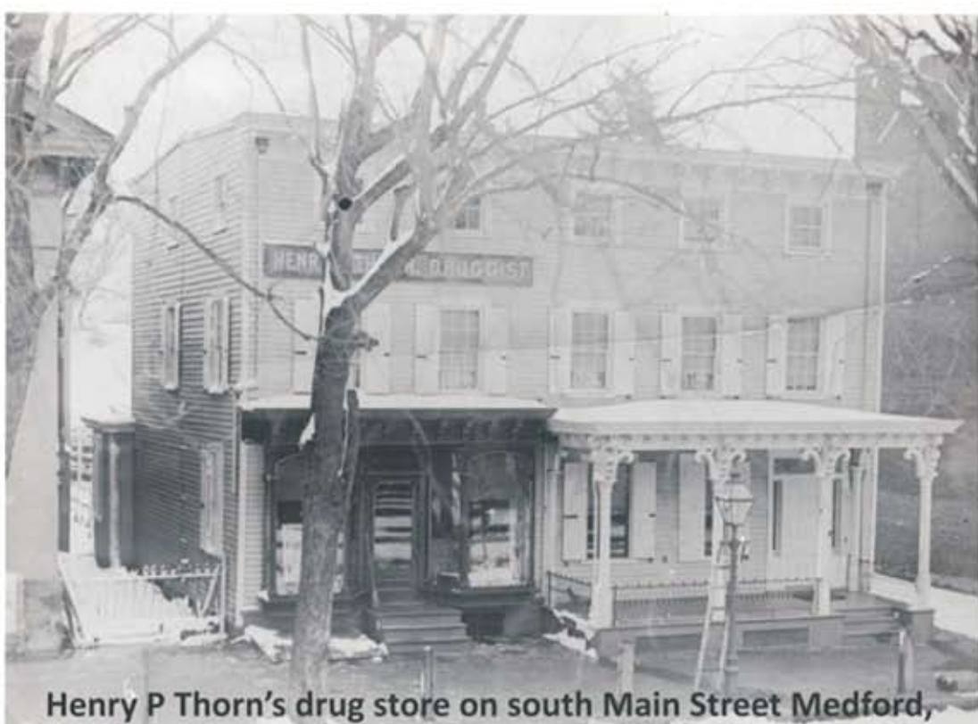
Henry P Thorn's drug store on south Main Street Medford, near the present day Pop Shop.

"Some twenty-five miles south of Trenton and about eighteen miles east of Camden, in Burlington County, New Jersey, there lies the pretty little town of Medford, a shopping center for a large farming territory which surrounds it on all sides. In this little town of about two thousand people, there is a single pharmacy, sufficiently old-fashioned to be recognizable as a place where drugs and medicines are dispensed, and sufficiently modern to provide the many services which our most modern apothecary shops are expected to render in this machine age. Since 1870, Henry P. Thorn has been a daily, active participant in the life of this pharmacy, and since 1875 he has been its proud owner. More than sixty years in the "drug business" is a good enough record for anyone, but to have spent all these years in the same location speaks volumes for the man who can claim this record."