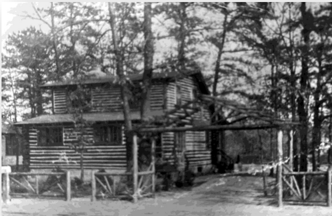
Bill & Marie Neugent House Built in 1935 On Taunton Boulevard

More homes were built in the 40s and 50s and more families became year-round residents. As time went on, sections were added to the footprint into the 90s and many of the original log cabins and cottages still remain. Today, there are approximately 480 homes that have the option to be members of the Lake Pine Colony Club. The community offers a wide variety of social events to accommodate residents of all ages. However, it's still the swimming, boating and fishing along with all the natural beauty and wildlife that makes us call Lake Pine our home, much like it did for the original Lake Piners 100 years ago!