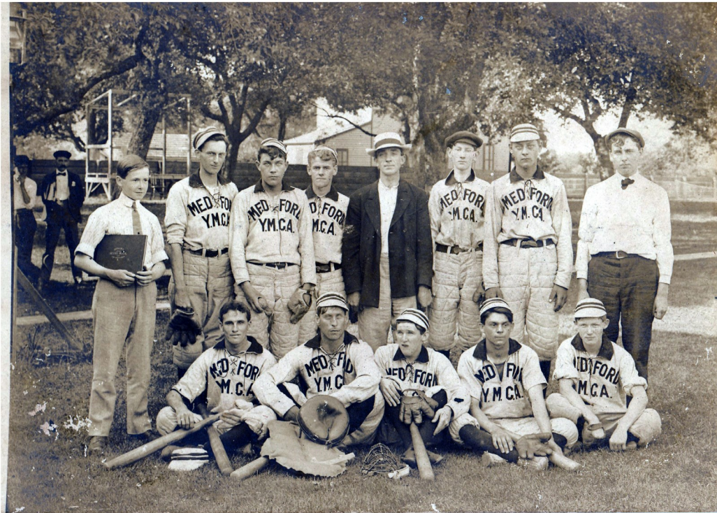
Medford YMCA Baseball Team (Date Unknown)

Another example of a local club is the Medford YMCA, which fielded a team in the early 1900's.