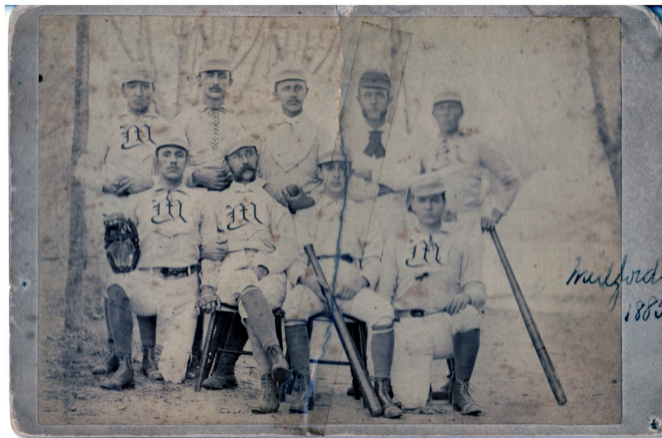
Medford Baseball Team Circa 1885

Besides the BCBL, many communities and organizations fielded teams in a variety of local leagues. I would imagine it is analogous to little league teams found in various communities today with colorful team names and sponsors. The Lake Cotoxen Hawks appear to be an example of one of those local teams.