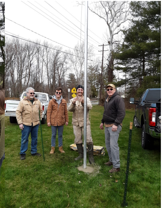
Flag Pole Restorers