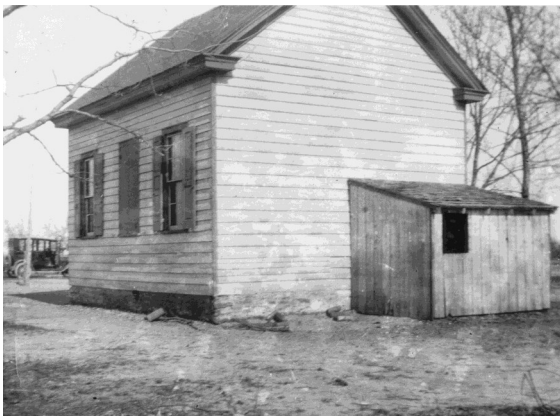
Brace Road School

An extensive library of local history books and historic craft books related to the Museum's collections was provided by a Society member. The membership is welcome to peruse the growing library.