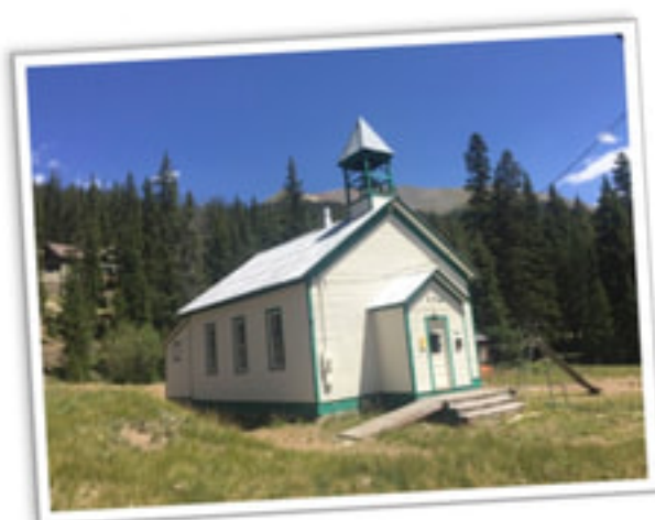
1884 Montezuma Schoolhouse, Montezuma, CO